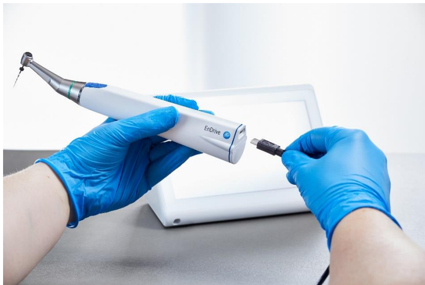
Caption: Komet EnDrive – Simplicity without compromise on safety.