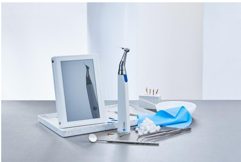
Caption: Komet EnDrive – Solution for individual requirements.