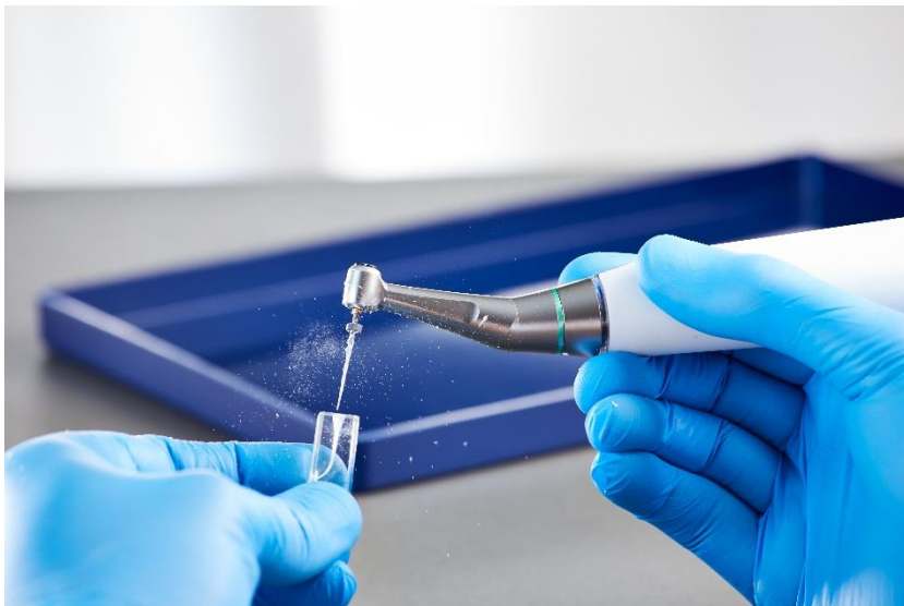
Caption: Komet EnDrive – Designed to meet the individual requirements and wishes of dentists and endodontic specialists.