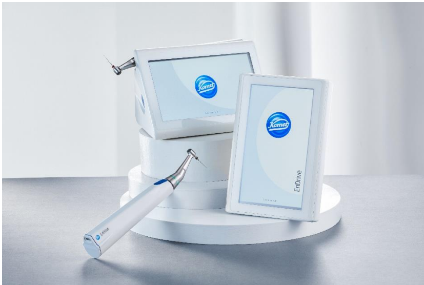
Caption: Komet EnDrive – State-of-the-art motor developed to meet customer requirements.