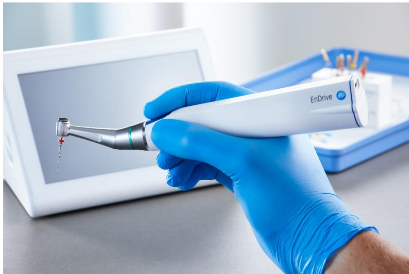
Caption: Komet EnDrive – Plug and play, convenience and intuitive operation.